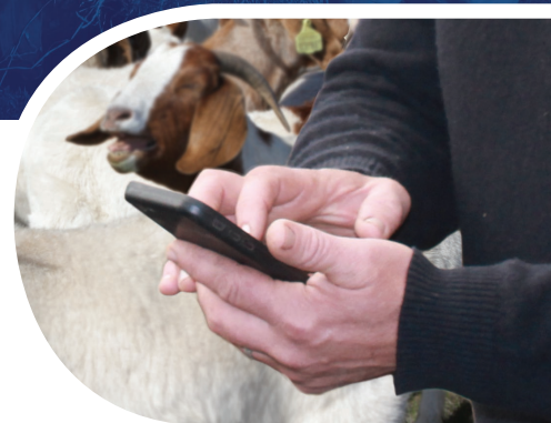
National Vendor Declarations are now available electronically (the eNVD)

The National Livestock Identification System (NLIS) is Australia's system for the identification and traceability of cattle, sheep and goats. The NLIS combines three elements to enable the lifetime traceability of animals: a visual or electronic ear tag, a Property Identification Code (PIC) for identification of physical location, and online database to store and correlate the data. Visit www.nlis.com.au